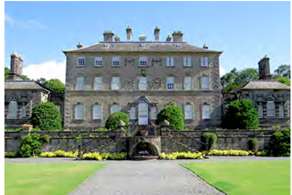
Inspiring architecture and gardens available to draw and paint at Pollock House which is a Property belonging to The National Trust for Scotland. NB It is therefore advisable that NTS members have their cards with them for admission and parking.

contact: stuart 0131 552 2620 (message) stuart@trinitygrove.demon.co.uk