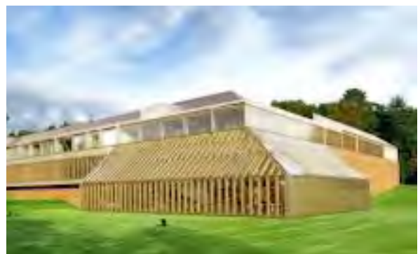
The Burrell Collection above and The House for an Art Lover are open daily and have cafe and shop and exceptional interiors for drawing in inclement weather.