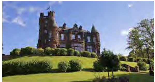
Sherbrooke Castle Hotel is an imposing neighbour to the Sherbrooke St Gilbert's venue and offers plenty of stimuli for architect-artists.....