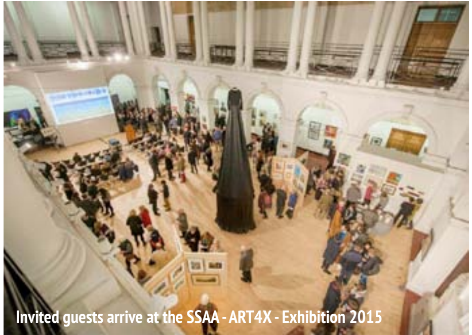
Invited guests arrive at the SSAA - ART4X - Exhibition 2015

Membership of the SSAA and Ligne et Couleur Scotland, is open to all students of architecture, past and present, registered or retired architects together with expatriates of the foregoing description. In special circumstances the Society may also elect Honorary Fellows, and Affiliates to membership.