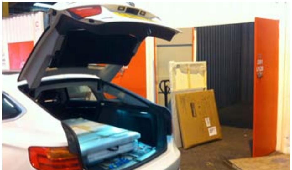
Transfer of works via secure art storage allows more flexible receiving and collection days.