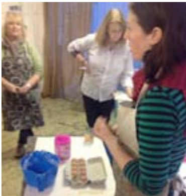
Egg Tempera Workshops (above) and iPad seminars (below) inform and inspire us to explore new techniques and technologies, and consolidate strong relations between artists and architects.