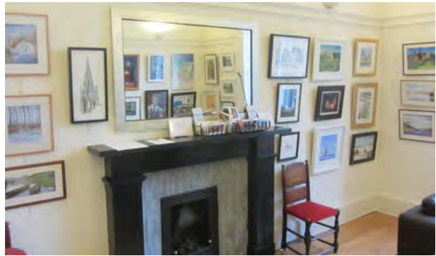
SSAA EXHIBITION IN RIAS til 25 Jan '13. SSAA SEMINAR painting on an iPad