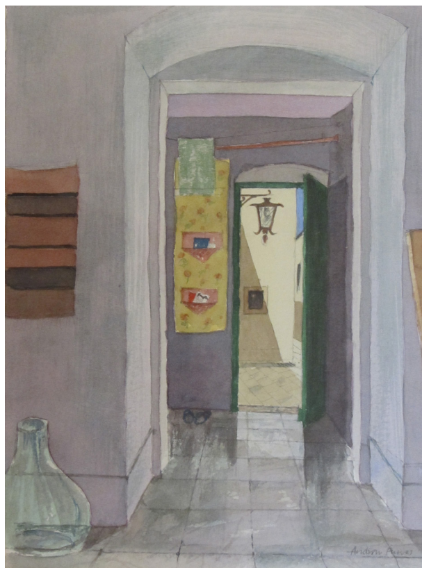
Alan Purves, Doorway. - winner of the SSAA Award for 'Best Three Works' in the SSAA Spring Exhibition 2012

As usual we propose to produce an illustrated e-catalogue for the exhibition. In order to be included please send a JPG of at least one work along with titles etc, to: stuart@trinitygrove.demon.co.uk