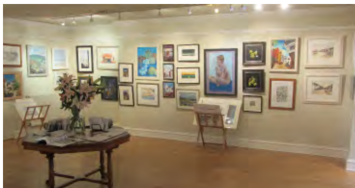
SSAA Spring Exhibition '13 at the Dundas St Gallery