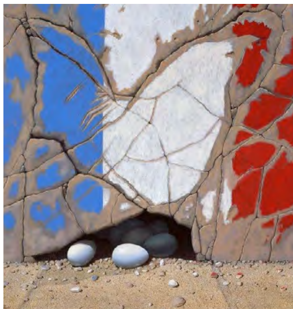
GUEST ARTIST: GORDON MITCHELL

SPRING EXHIBITION 2013 DUNDAS STREET GALLERY