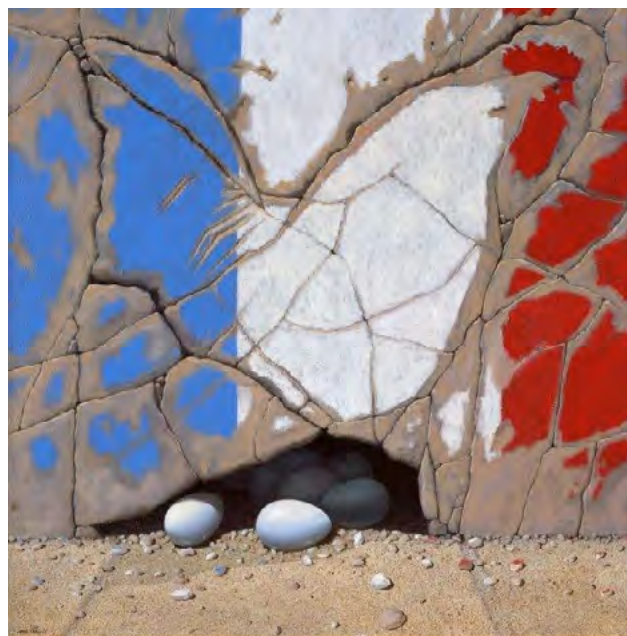
GUEST ARTIST: GORDON MITCHELL RSA RSW RGI

SPRING EXHIBITION 2013 DUNDAS STREET GALLERY