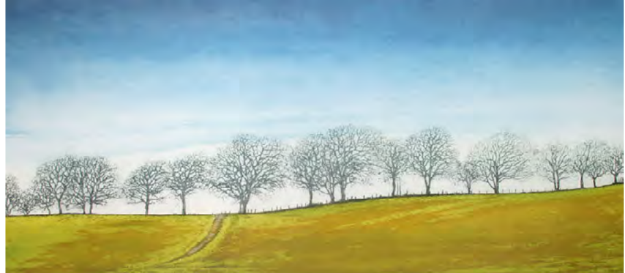
Top: Treeline, by Ian McNicol